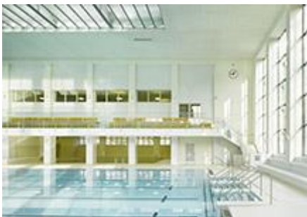
ernst niklaus fausch Architects Retrofit Indoor Swimming Pool 'City', Zurich