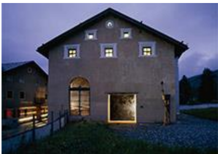
Ruch & Partner Architects AG