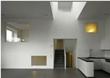
EM2N Architects AG Conversion Rosenberg, Winterthur