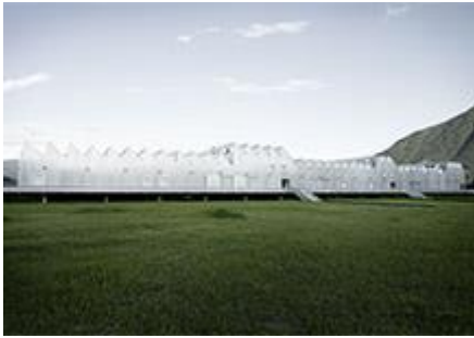
Durisch + Nolli Architetti Sagl Education centre Schweizerischer Baumeisterverband, Gordola