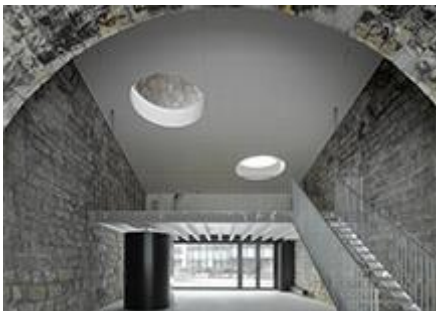
EM2N Architects AG Conversion Viaduktbögen, Zurich