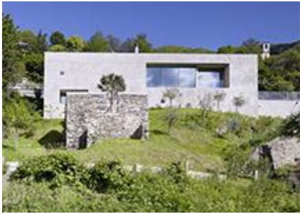
Wespi de Meuron Romeo Architects BSA AG