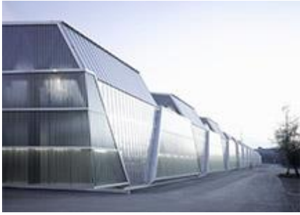
Penzel Valier AG