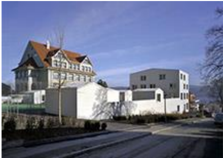
Ramser Schmid Architects